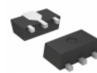
S-1131B27UA-N4MTFU SII Semiconductor Corporation IC REG LINEAR 2.7V 0.3A SOT89-3