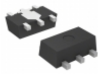
S-1131B26UC-N4LTFG SII Semiconductor Corporation IC REG LDO 2.6V 0.3A SOT89-5