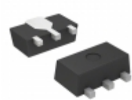
S-1131B26UA-N4LTFG SII Semiconductor Corporation IC REG LDO 2.6V 0.3A SOT89-3