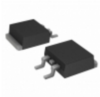
MBRD330TRR Vishay Semiconductor Diodes Division DIODE SCHOTTKY 30V 3A DPAK