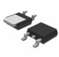
MBRD340 ON Semiconductor DIODE SCHOTTKY 40V 3A DPAK