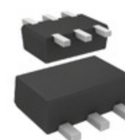
DMC566040R Panasonic Electronic Components TRANS PREBIAS DUAL NPN SMINI6