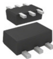
DMC564070R Panasonic Electronic Components TRANS PREBIAS DUAL NPN SMINI6