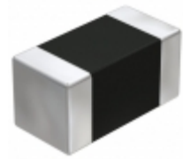
UMK105CG390JVHF Taiyo Yuden CAP CER 39PF 50V NP0 0402