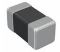
UMK105CG361JVHF Taiyo Yuden CAP CER 360PF 50V COG/NP0 0402