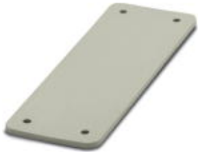
HEAVYCON cover plate, for panel cutouts of type B16/HV6, 3.5 mm thick, gray

Please be informed that the data shown in this PDF Document is generated from our Online Catalog. Please find the complete data in the user's documentation. Our General Terms of Use for Downloads are valid ( http://phoenixcontact.com/download )