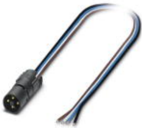
Assembled contact carrier and insulating body, T-coding, 4-pos., 0.5 m long litz wires

Please be informed that the data shown in this PDF Document is generated from our Online Catalog. Please find the complete data in the user's documentation. Our General Terms of Use for Downloads are valid ( http://download.phoenixcontact.com )